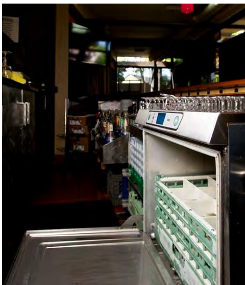
Figure 1: Undercounter Dishmachine at Bridges Restaurant

There are four main types of commercial dishmachines: undercounter machines which are commonly found in bars and juice shops, door-type machines which are found in most quick or full-service restaurants and are the subject of this study, rack conveyor machines which use a conveyor belt to send machines from the dirty side of the machine to the clean side and are typically found in large full-service restaurants and some cafeterias, and flight-type machines which use plastic fingers on a conveyor belt and are typically found in very large facilities such as universities and prisons. These types are pictured in figures 1 through 4. These machines have various throughputs and rates at which they can wash dishes. Dishmachines are generally sized based on the perceived highest necessary throughput at a facility, so they tend to be somewhat oversized.