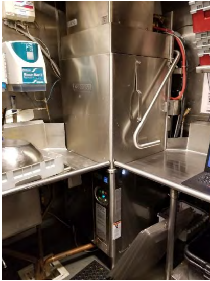
Figure 14: Hobart AM15VLT-2 as installed at Danville Brewing Company

Of the baseline machines monitored, the dishmachine at Danville Brewing Company was the worst performer in terms of the amount of rinse water used compared to the manufacturer's specification. Ultimately, this replacement option had the best potential for saving the most water. Also, because the baseline machine was an exhaust heat recovery machine, the replacement at DBC represents a better like-for-like replacement so researchers could evaluate the incremental impact of a pumped rinse without as much conflation of other design differences in the two machines. One major operating difference between dishmachines with and without exhaust heat recovery is that heat recovery machines have longer wash/rinse cycles to allow time for the exhaust vapor to pass through the heat exchanger. This increases the time between racks washed. Restaurants transitioning from a conventional machine to one with heat recovery can experience a disruption to their workflow, and researchers avoided this so that the new machine wouldn't be rejected by the site.