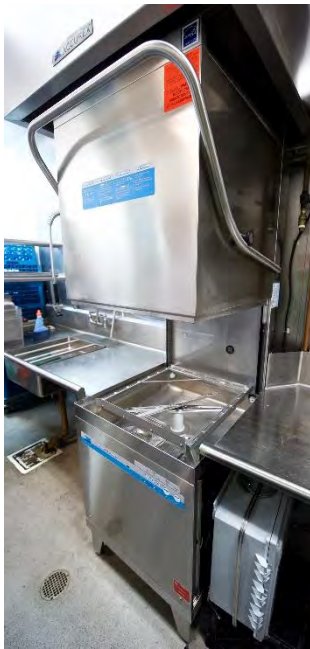
Figure 15: Meiko DV80.2 WAHRS as installed at The Counter

The data set from this study was enhanced with 5 additional machines from previous monitoring studies for a total of 9 machines. The additional dishmachines included an Ecolab ES2000 dump and fill machine found at Bridges restaurant in Danville, CA, which was replaced with a Hobart AM15VL with heat recovery and pumped rinse. Also represented are three machines at The Counter in San Mateo, CA: a CMA180 high temperature pressure-fed dishmachine, a Champion DH5000-VHR high temperature pressure-fed dishmachine with exhaust heat recovery (replacement 1,) and a Meiko DV80.2 WAHRS pumped rinse machine (replacement 2) (figure 15) with exhaust heat recovery.