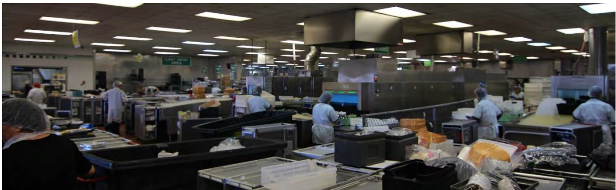
Figure 4: Flight Conveyor Dishmachines at Gate Gourmet