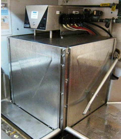
Figure 2: Door-Type Dishmachine at Bridges Restaurant