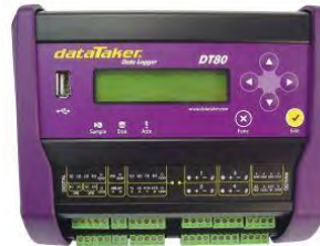
Figure 10: DataTaker DT-80