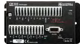
Figure 9: Campbell Scientific CR300