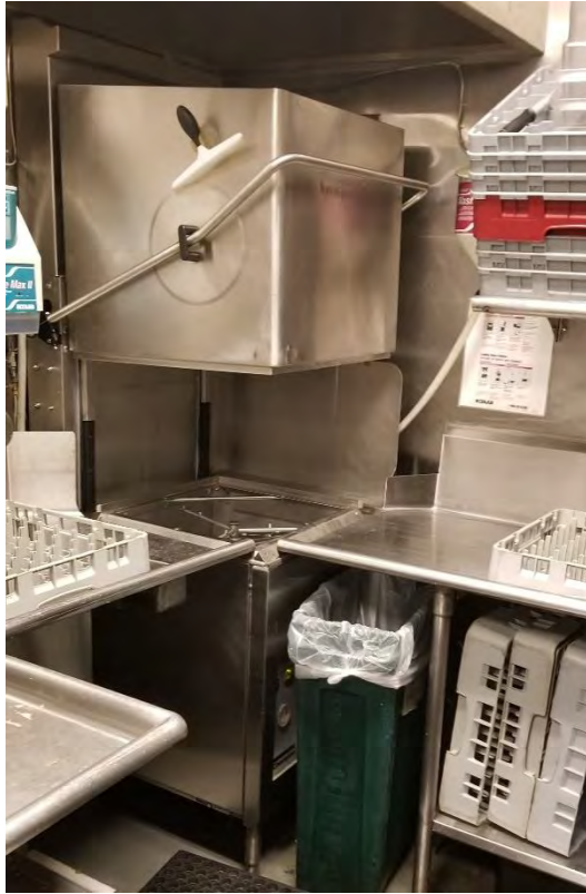
Figure 13: Champion DH5000-VHR as Installed at Danville Brewing Company