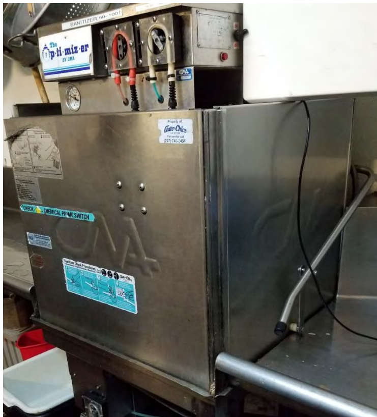
Figure 12: CMA EST-AH as installed at La Tapatia

The dishmachine onsite was a CMA EST-AH (Figure 12) which was first purchased and installed in 2008. Because the median age of door-type dishmachines is between 5 and 7 years, the machine at La Tapatia represents an older machine. The machine was chosen for monitoring because it was a dump-and-fill machine, which needed to be represented in the final data set. This was a low temperature machine with a final rinse temperature at 140°F. It did not have its own booster heater and was fed entirely with hot water from a standard efficiency tank-type water heater. The dishmachine and its pre-rinse spray valve are the only two appliances fed by this water heater, and the heater is located very close to the dishroom.