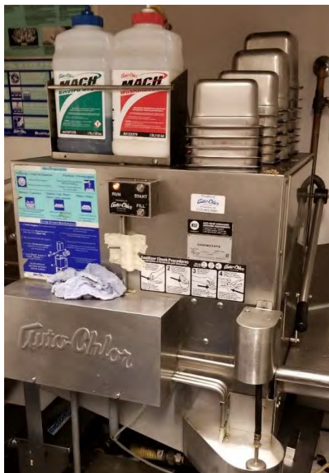
Figure 11: AutoChlor A4-L as Installed at Comal

The machine at Comal (Figure 11) was fed with hot water and had a low temperature rinse. The water entered the booster heater at 118°F and got boosted to a final rinse temperature of 160°F. This was a higher rinse temperature than most low temperature chemical sanitizing machines which typically operate around 140°F. This design temperature was likely chosen by the manufacturer to accommodate a detergent that is more effective at higher temperatures.