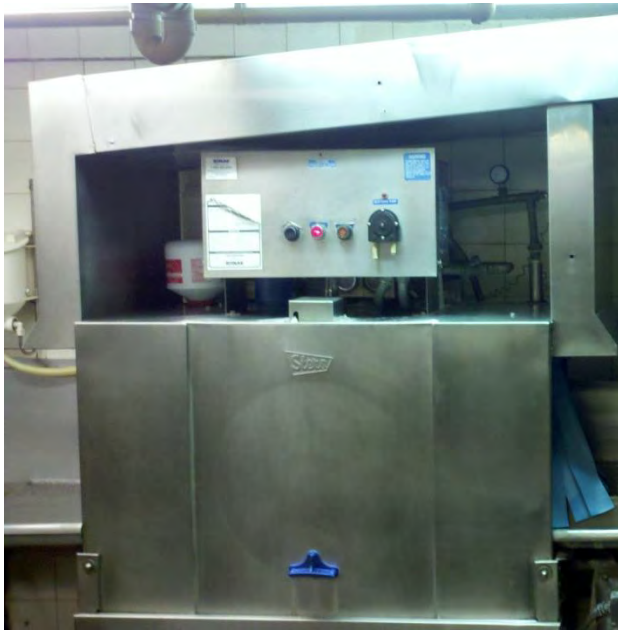
Figure 3: Rack Conveyor Dishmachine at Tadich Grill