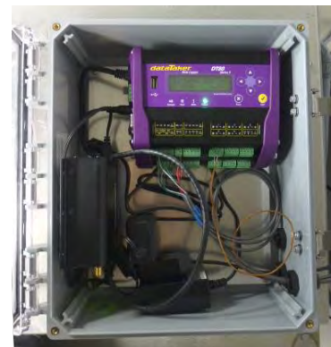
Figure 6: Enclosure with data logger and cell modem

Electric meters were installed to measure the energy consumption of all dishmachines which consumed electric power. The energy draw on the building's hot water system was determined by taking the amount of hot water consumed and assuming the water heater had an 80% thermal efficiency. The data loggers were installed in water-proof enclosures. Some were installed with cell modems, but there was a firmware issue between the loggers and the cell modems that researchers felt was unresolvable, so the cell modems were decommissioned and data was collected manually. The power for the data loggers was usually tapped from inside the dishmachine but there were a few instances where power could be drawn from an open wall socket.