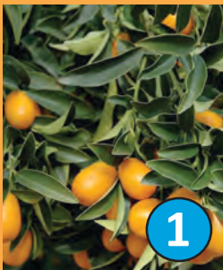
1 Citrus 'Nagami' Dwarf Kumquat