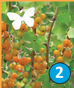
2 Ribes aureum Golden Currant