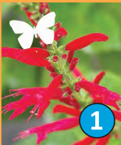
1 Salvia elegans Pineapple Sage