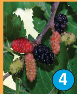
4 Morus nigra 'Persian' Persian Fruiting Mulberry