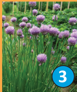
3 Allium schoenoprasum Chives