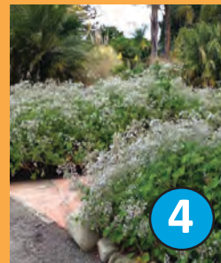
4 Pelargonium tomentosum Peppermint Geranium