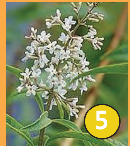
5 Aloysia citriodora Lemon Verbena