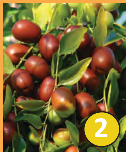
2 Ziziphus jujuba Jujube, Chinese Date