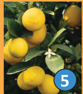
5 Citrus 'Improved Meyer' Improved Meyer Lemon