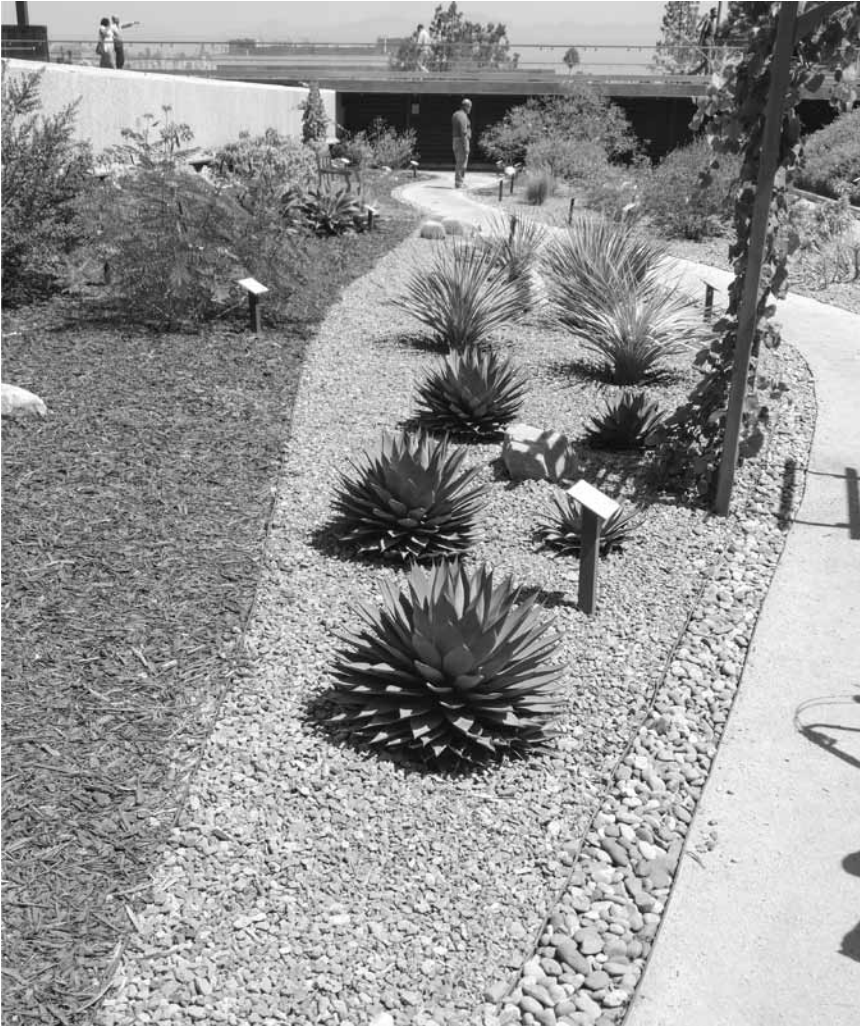
A California Friendly Landscape actively manages its surfaces, whether they be mulch, gravel, river rock, or DG. This picture illustrates good surface management. LADWP's headquarters, Los Angeles.

This chapter deals with walking surfaces, mulches, overcoming compacted soils and maintaining the grade of a California Friendly landscape.