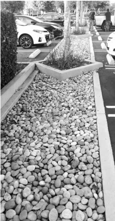
River rock has many uses. The stone can help enable infiltration, become a walking surface, and provide strong aesthetic elements. Cal Poly Pomona.

River Rock: Though beautiful in appearance, ideal for Mediterranean plants, and a good solution for shady and windy areas, river rock has several disadvantages. For one thing, it is one of the most expensive mulches. It is also a difficult mulch to weed. Weeds will eventually root in the debris that has settled on the landscape fabric, and reaching in and around rocks to remove them makes weeding a time-consuming task. Flaming is an option if the rock is more than 6" deep and there is no leafy debris. Note, the smaller the river rock, the easier it is to weed. At least twice a year vacuum or blow the rock to remove debris.